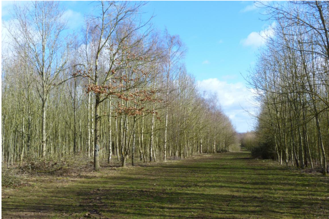
The Main Ride 2015