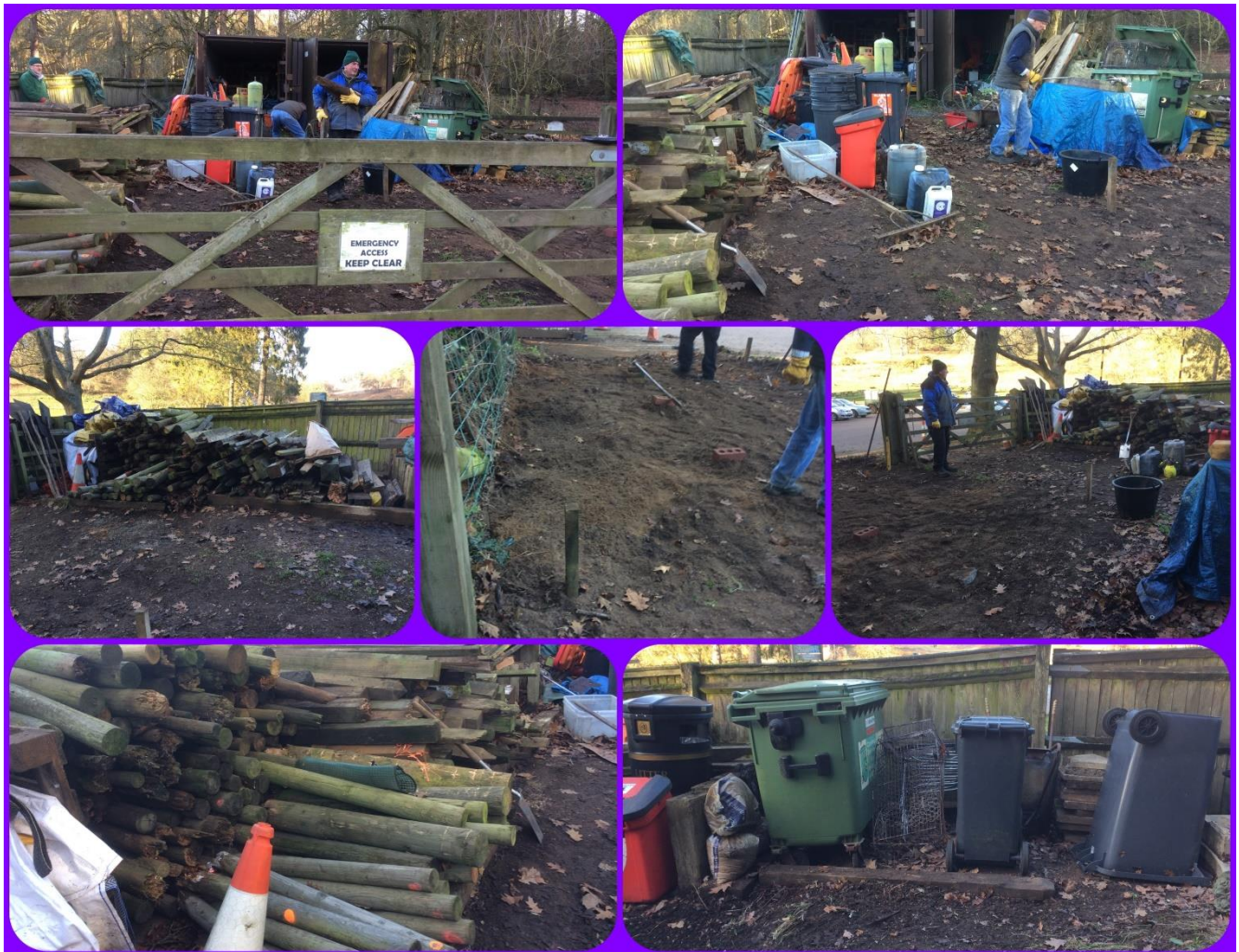
The centre photograph shows the land cleared and marked ready for the Pink Tank!