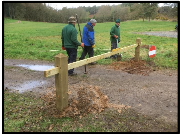
Look from here and you'll see what I mean