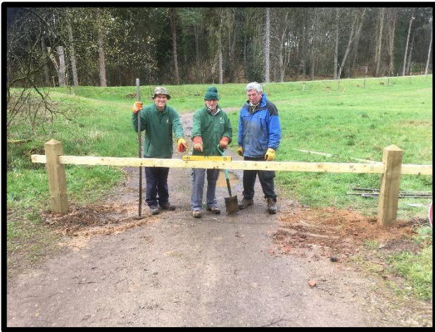
I'm telling you it's b***** level

A Gary Gate – a carefully designed piece of engineering, fag packet notwithstanding. The first is installed at the lower entrance to the meadow near the new shed on 2nd April. This long awaited, lockable barrier is to stop those lazy dog-walkers from parking where they should not!