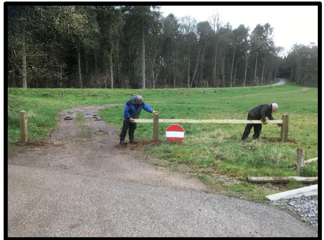
You push and I'll pull

The following week, 9th April, 3 more Gary Gates were installed – here are two of them!