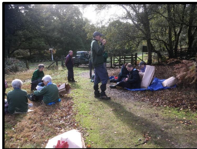
“Doughnuts help us to WORK, REST and PLAY”

At the meadow end of Heron Valley, beyond the abandoned Christmas Tree plantation is a small fenced enclosure that is said to have some special flowers and mosses. Here the volunteers cleared the small birch trees and brambles.