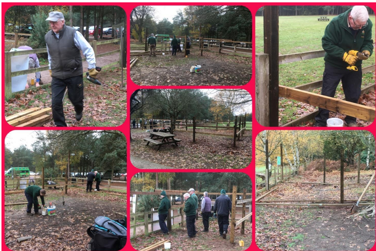
November 19th & 20th - Annual Christmas Tree Corral building and stacking