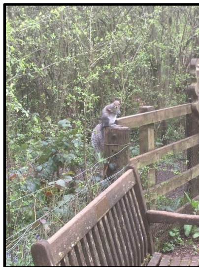
and a Stockgrove resident pinching bird seed!