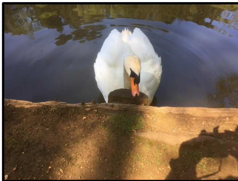
Finally - A Stockgrove Swan