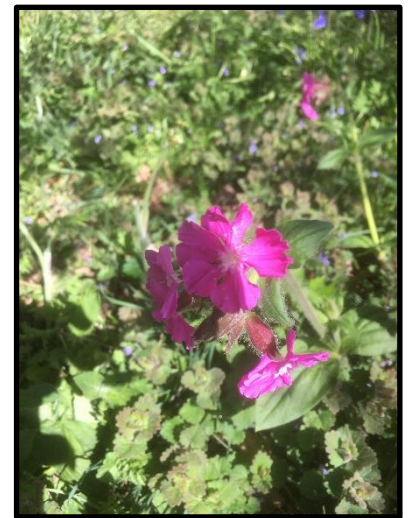
Rushmere Spring Flowers