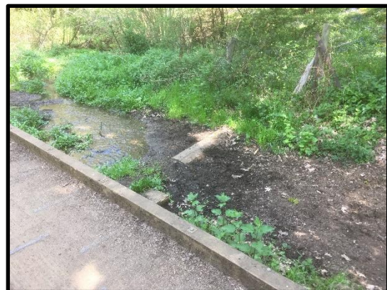
Cuff Lane (meadow needing our attention)