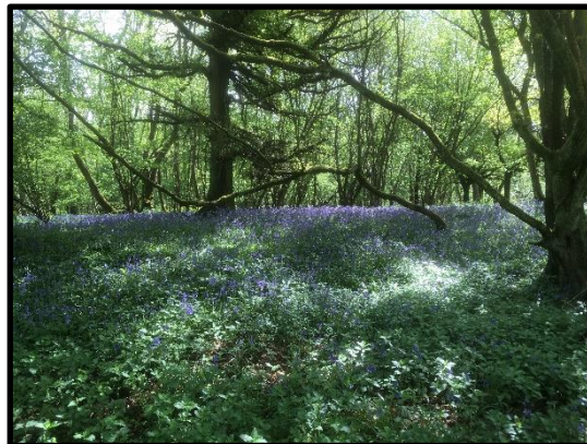
Rannamere and Braggenham Wood Bluebells