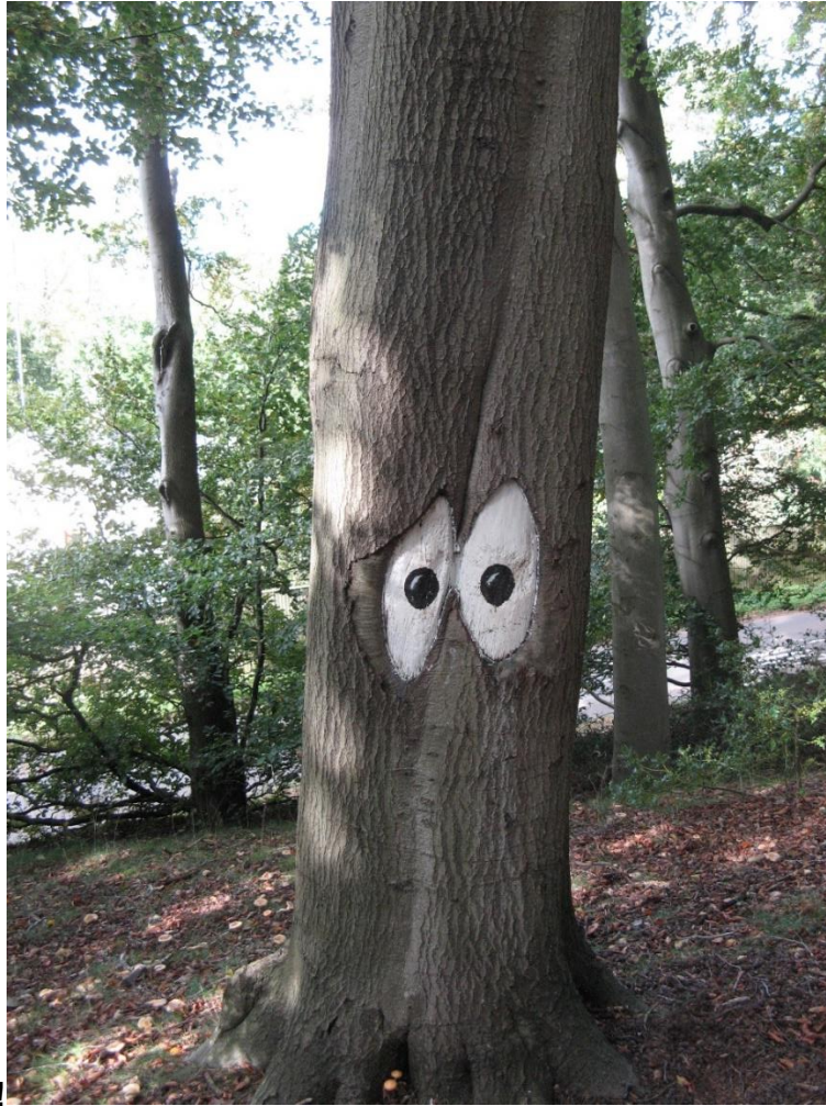
Here's Lookin' at you kid!

Taken during the Heath Wood Holly Bash Task on 2nd October 2020