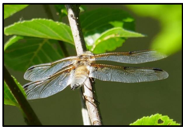
2 more from Graham's collection