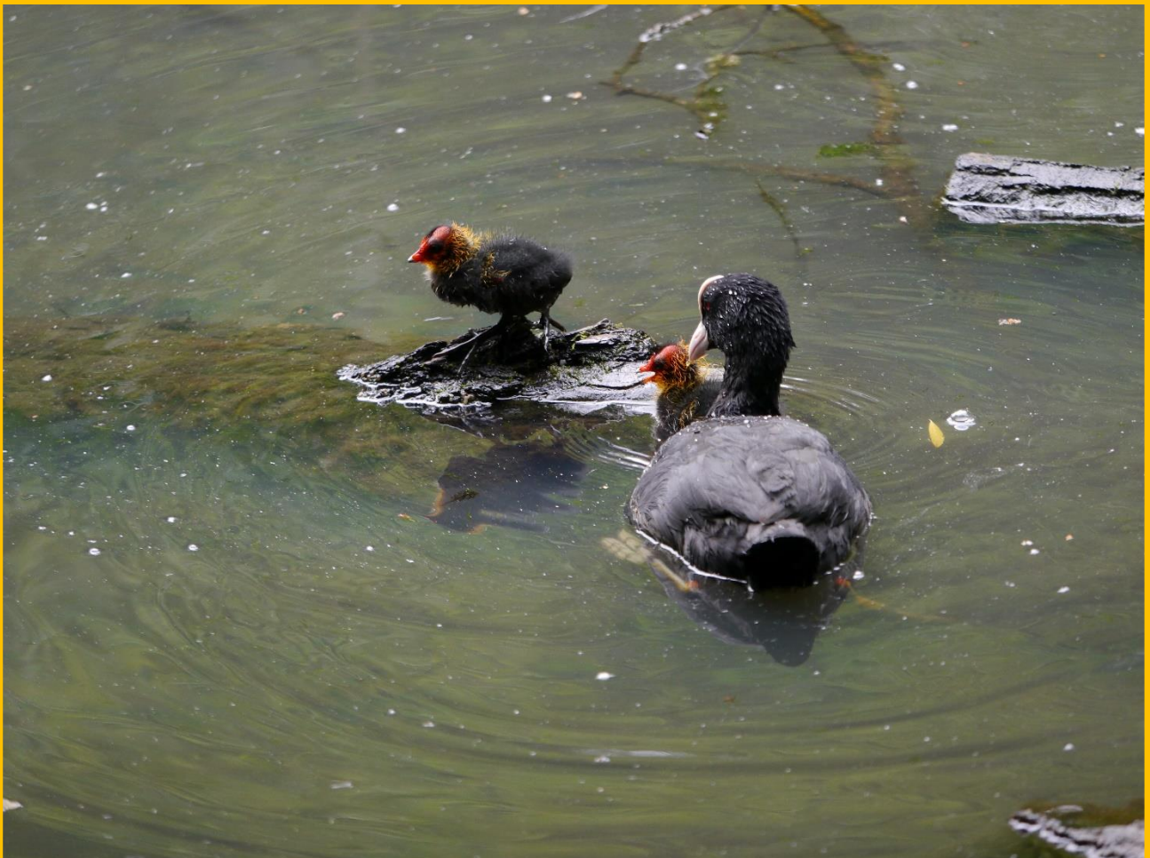
Cute Chicks (Sorry - Coot Chicks).