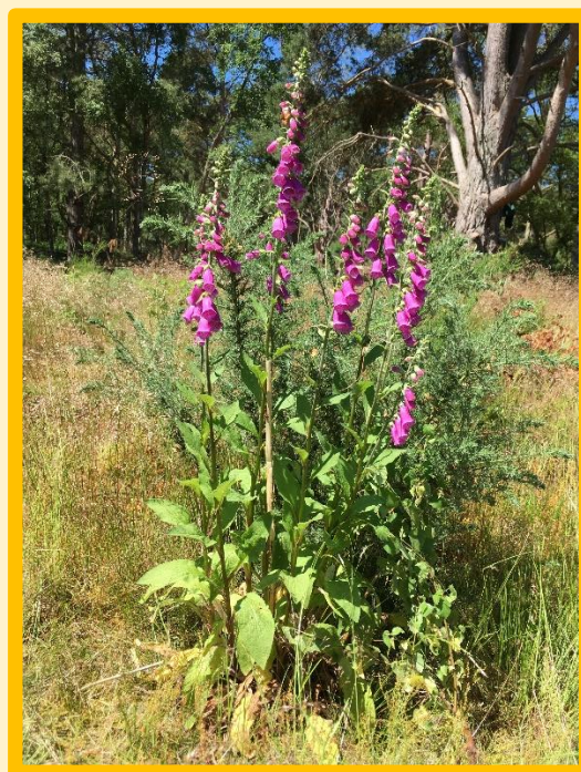
The Foxglove photo taken a couple weeks later (16th June).