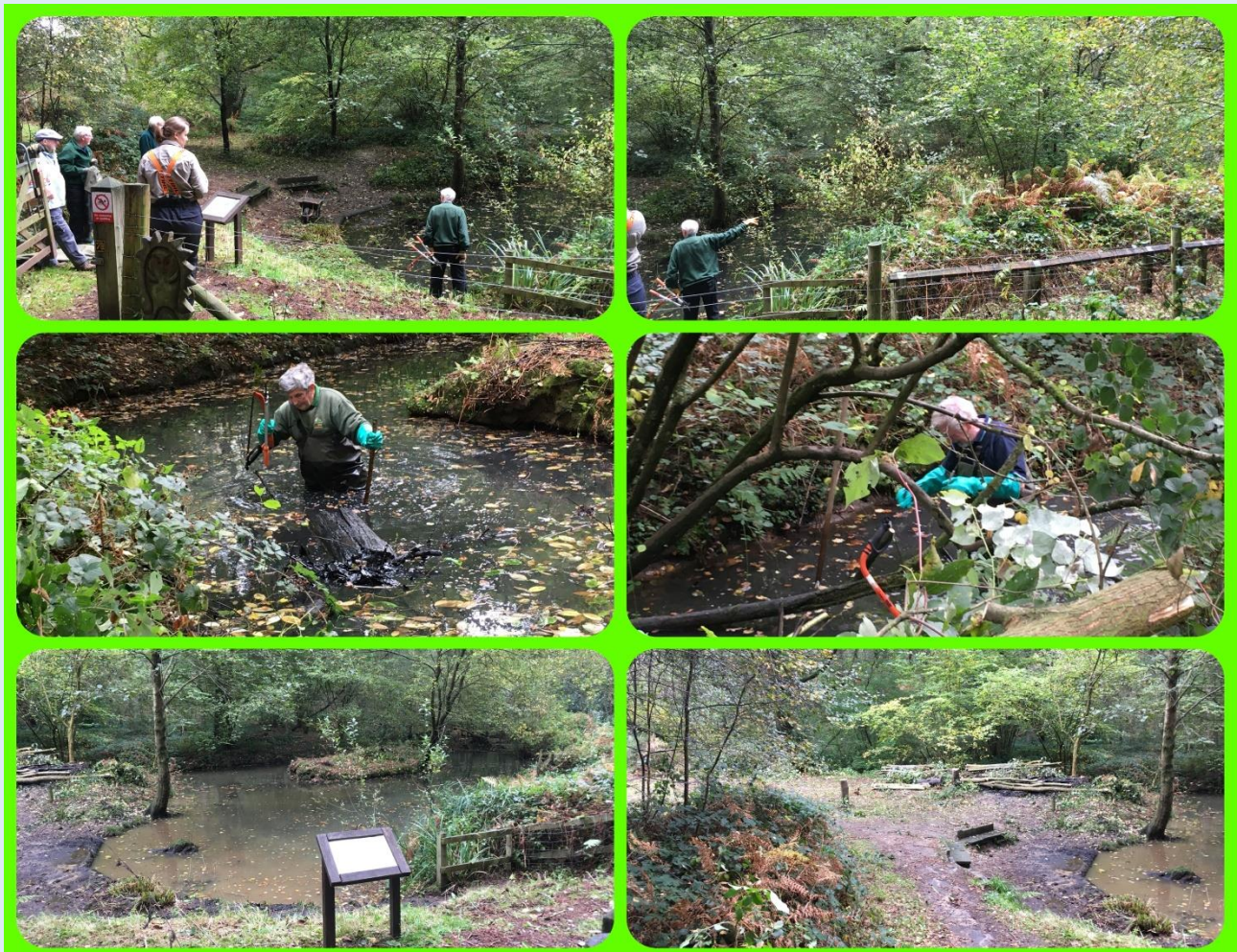
Top: Discussion on what's to be done Middle: Derek and Paul in the pond Bottom: Pond and surrounds are now clearer