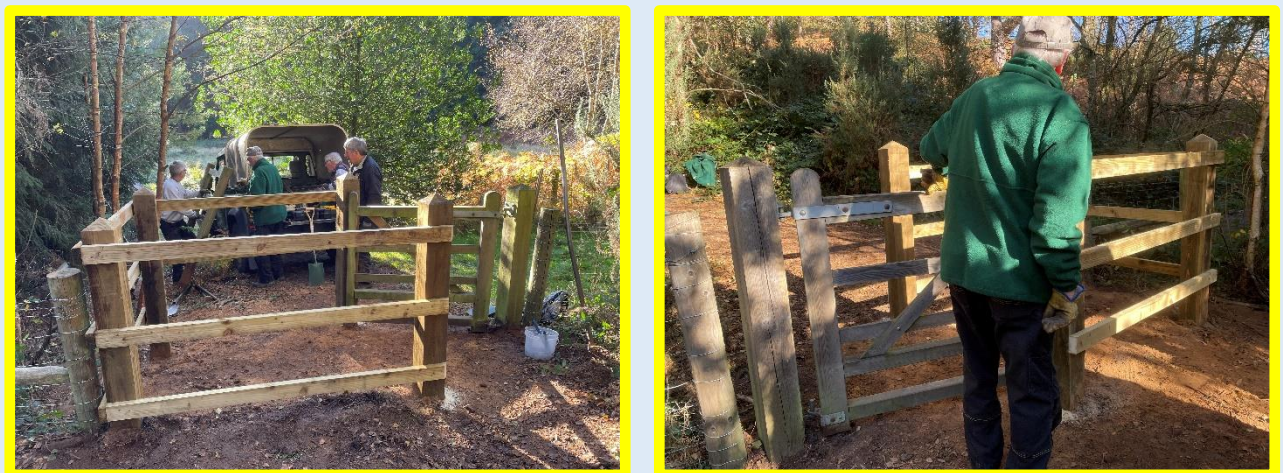
Admiration of all our hard work or someone finding fault?