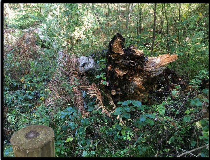
The Silver Birch