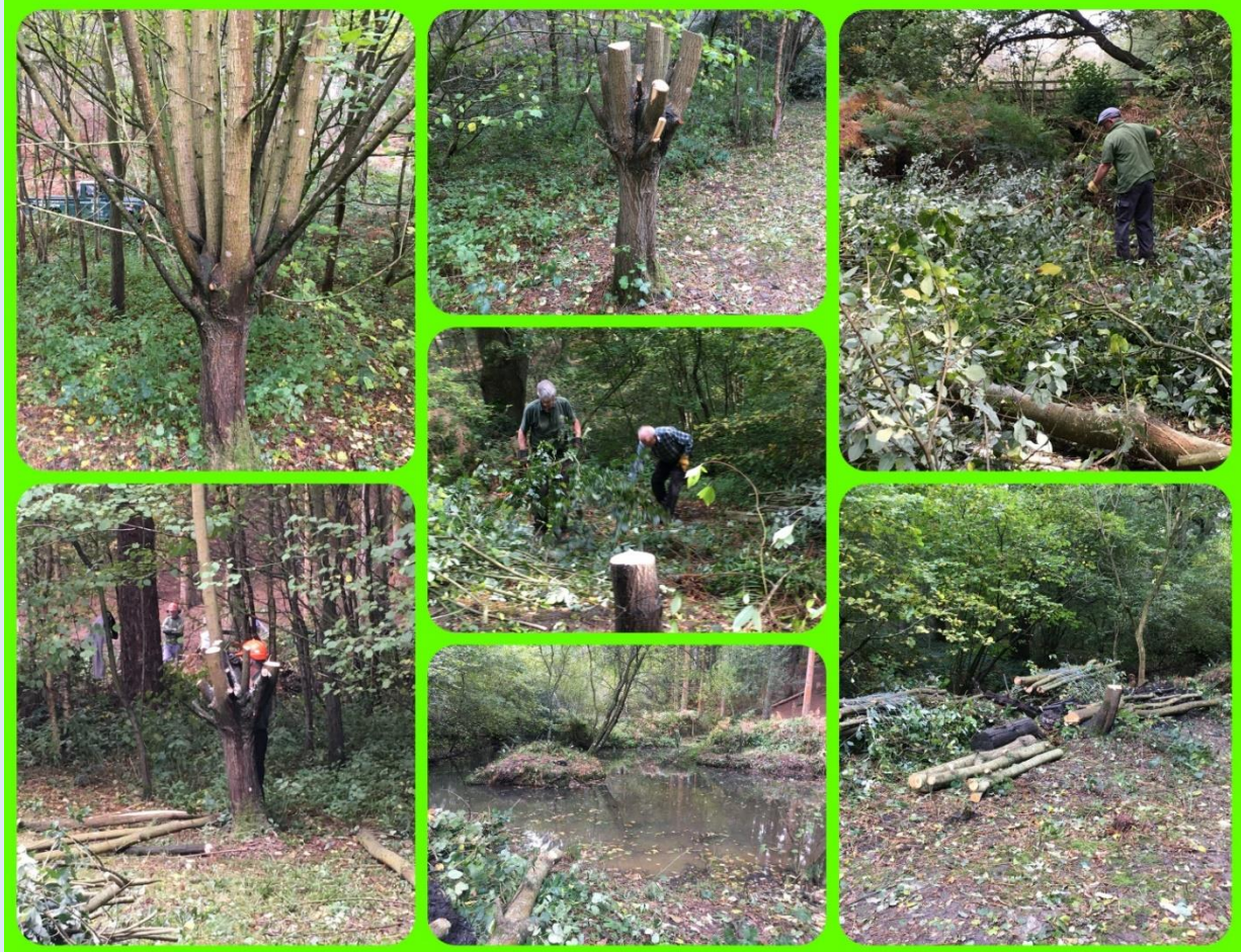
Those not in the pond, pollarded (scalped more like it) and cleared some trees from the area to the left of the pond!