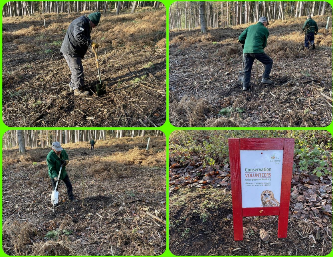
Planting pulled birch (in a different location) Tuesday 11th January 2022 – Nightjar Valley Gate Repair