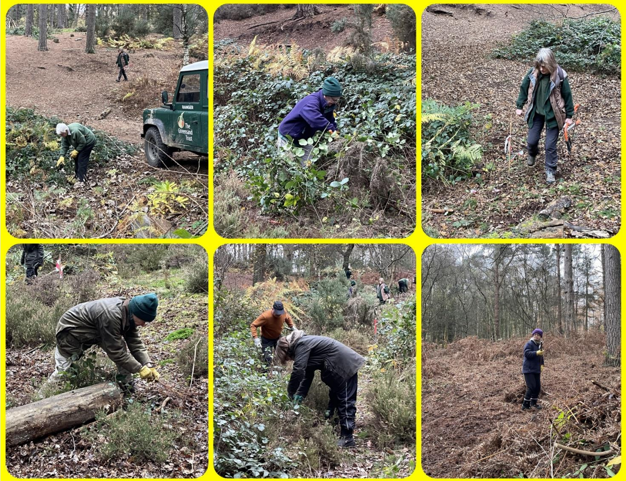
Rogues Gallery – Volunteers at Work