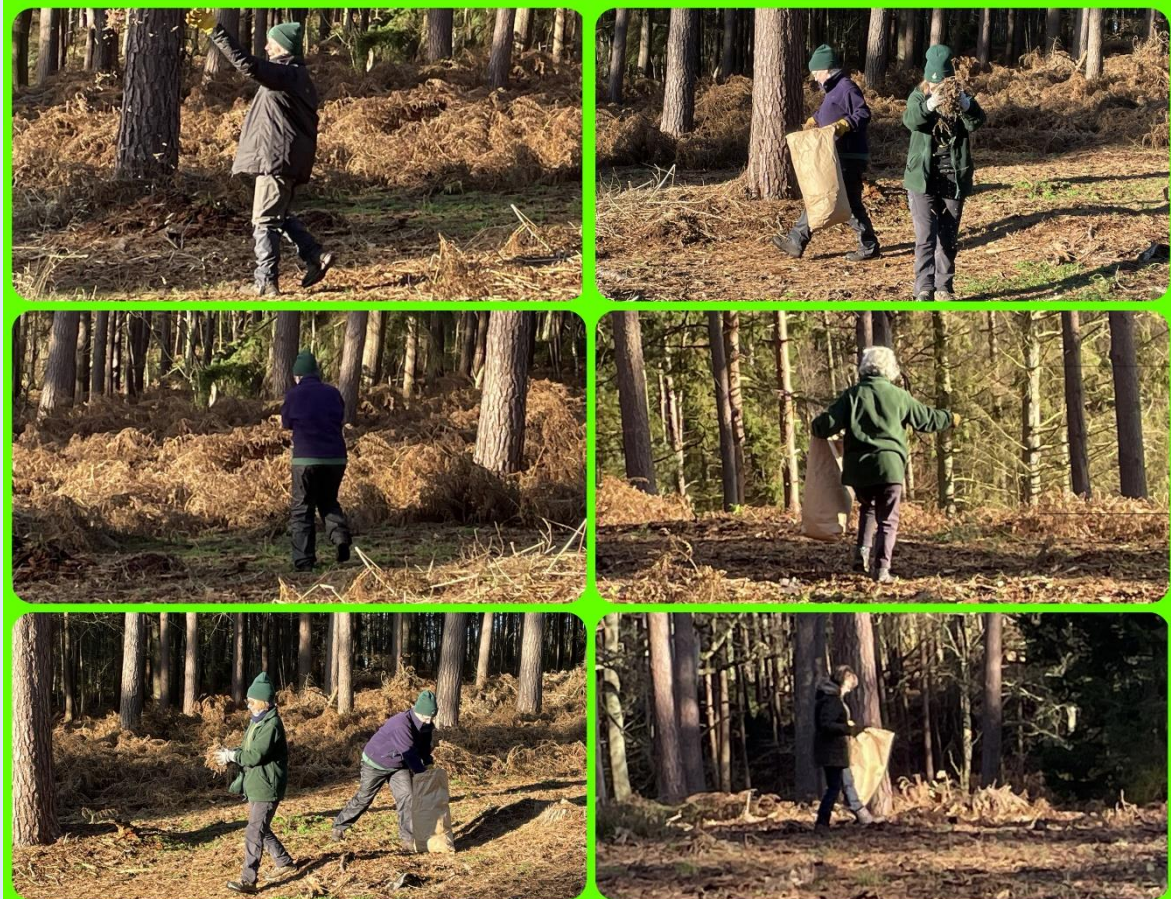
Sowing heather seeds