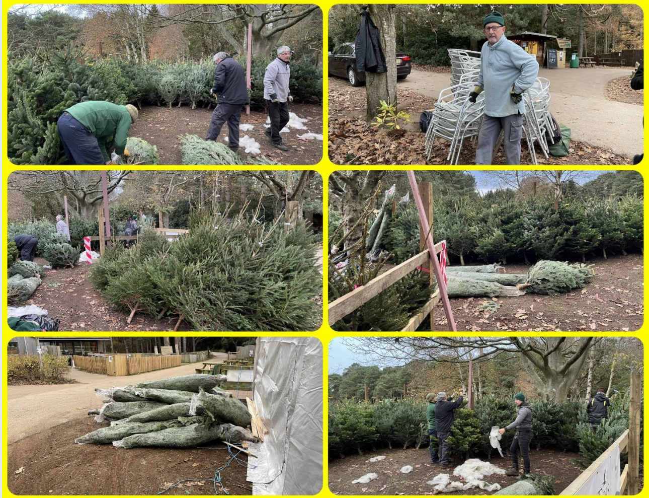
Tuesday 30th November 2021 – Rushmere Fence Repair