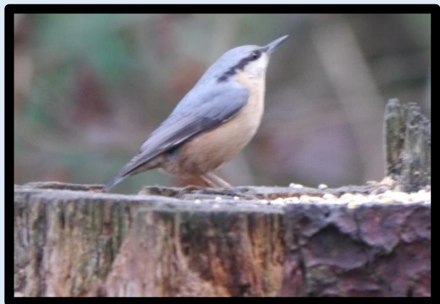
Nuthatch feeding at the stump table at Stockgrove