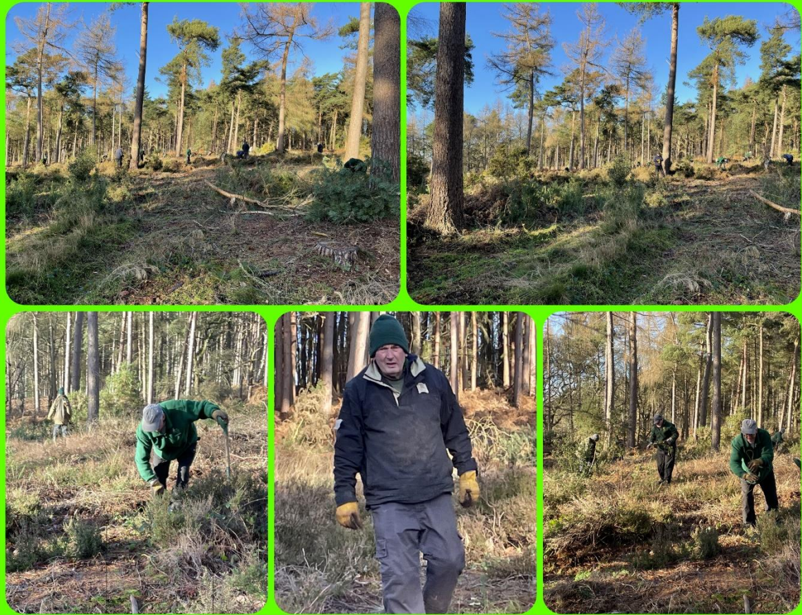
Oak Wood in the sunshine – while pulling birch, bramble & pine